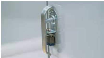
Cutter-proof padlock hasp handle