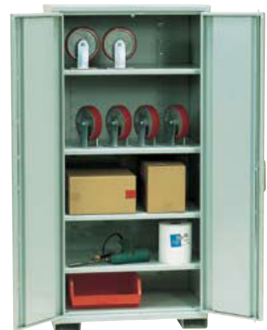
Model 1810 (forklift slots optional)