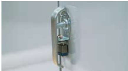
Cutter-proof padlock hasp handle