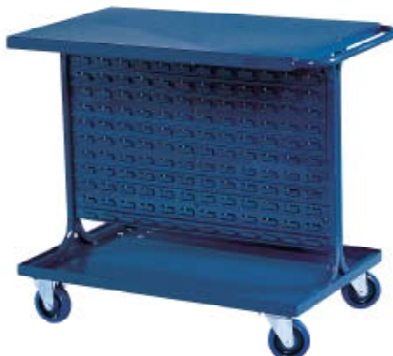
Model 1070 (without bins)