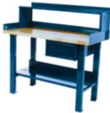
Model 1753 with accessories