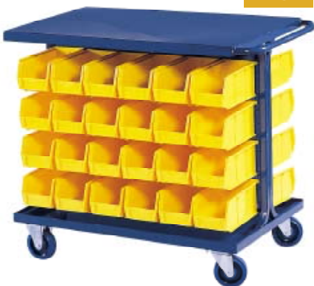
Model 1070 (with bins)