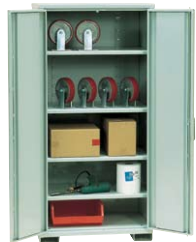
Model 1810 (forklift slots optional)