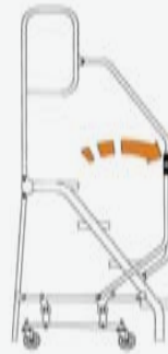
Pull lever: to lift feet and move ladder